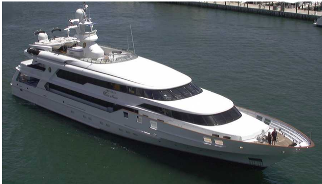
50m motoryacht Princesa Valentina , Vosper stabilizer retrofitted with a Naiad DATUM S@A™ system.

Effective roll damping of a vessel not making headway, such as when at anchor or adrift, has been a persistent motion control problem. As marinas become increasingly crowded and slips more difficult to obtain, passengers and crew are more frequently aboard under anchored or moored conditions. Harbors, being busy and relatively shallow, often generate wave conditions that cause significant rolling, especially when the wave period nearly matches the vessel's natural period. Uncomfortable anchorage conditions are further exacerbated by tides and