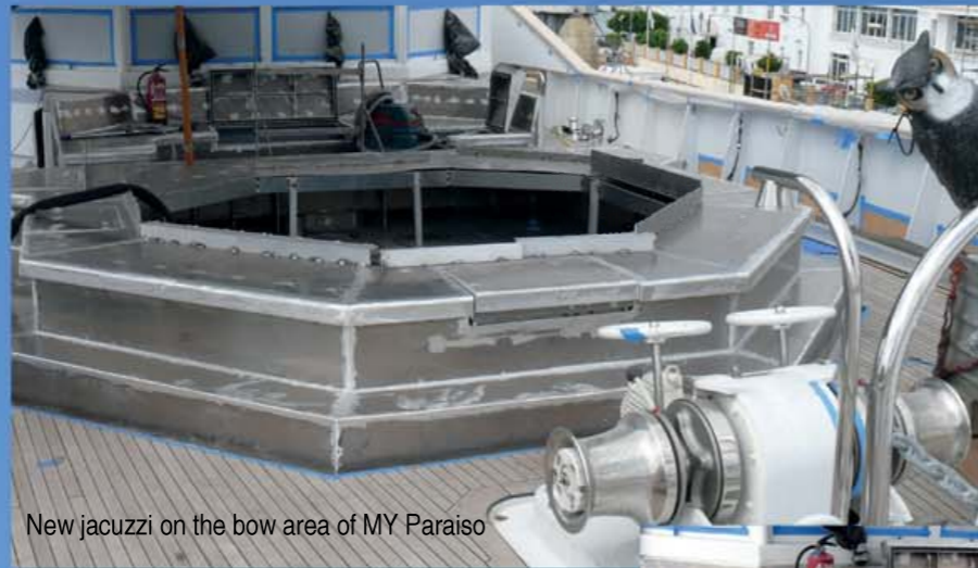
New jacuzzi on the bow area of MY Paraiso

During the last week the efforts of several Spanish associations have started to bear fruit as the Balearic Parliament has approved a bill requesting the central government to use the same yacht tax system as neighbouring EU countries.