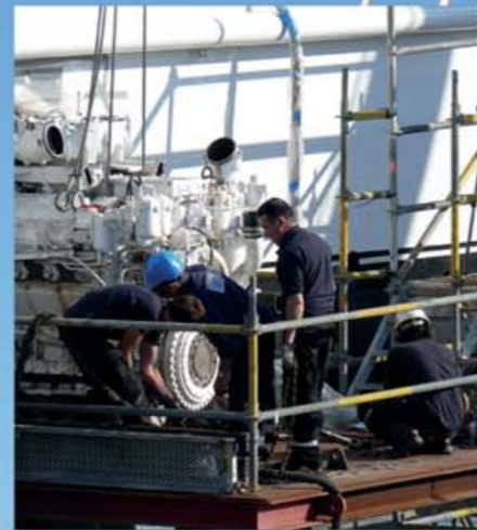
Taking out the old engines through the side of the hull.