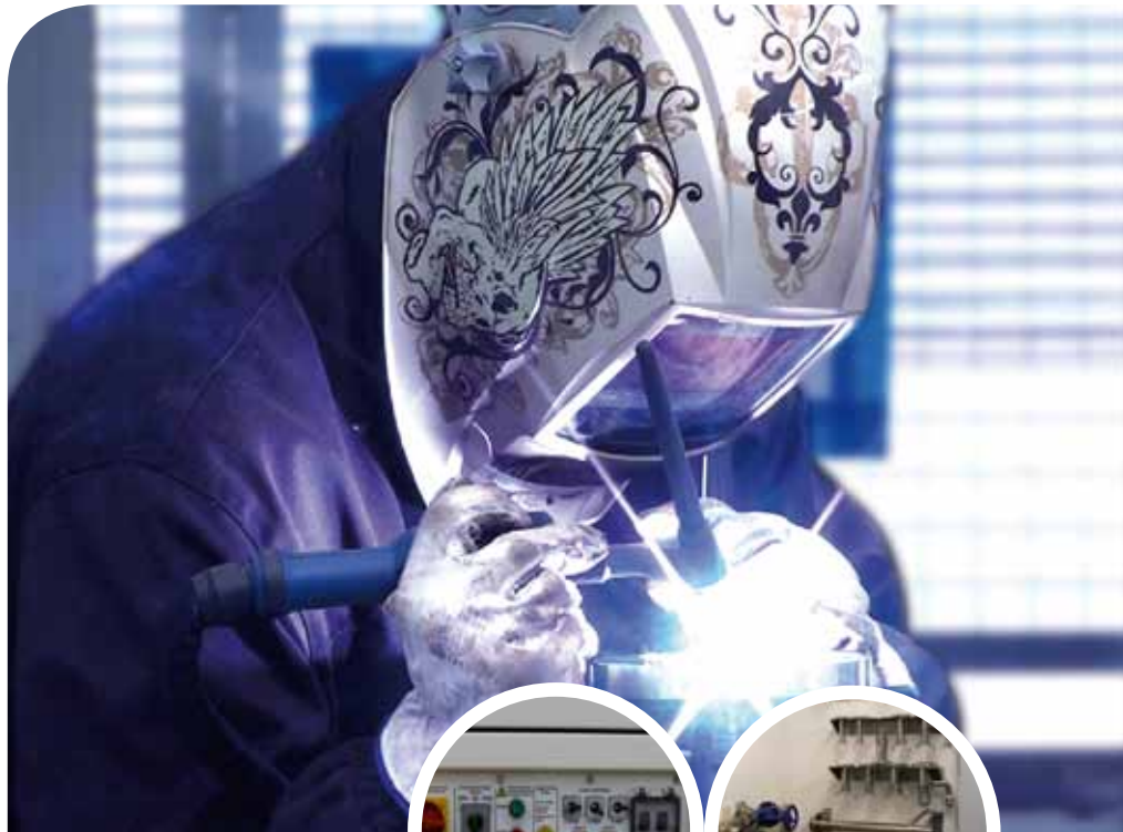
The TIG Welding machine allows us to weld sheets of up to 40mm without pre heating.

The workshops have been newly equipped with a Ultrasonic cleaner, Load Bank, Laser alignment unit and Hydroblaster and the pump testing unit was specially built to provide an accurate image of the actual flow delivery of pumps.